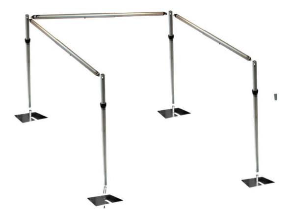
FINISHED BOOTH SET-UP